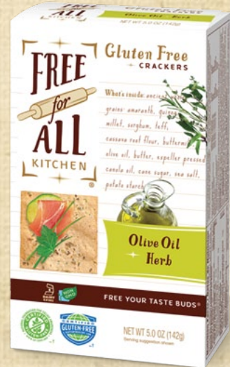
OLIVE OIL & HERB