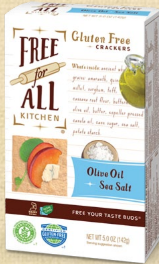
OLIVE OIL & SEA SALT